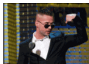
A&F: Situation, do not wear our stuff