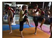
Photos: Thailand tourists get kicks