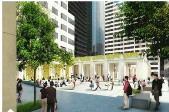
Skidmore, Owings & Merrill LLP / Skidmore, Owings & Merrill LLP

The 50 Fremont office tower includes a plaza, left, that has been replanted, but not renovated since opening day in 1983. Plans now call for a total redesign to allow more flexibility, in which the center is active and the perimeter is quiet.