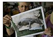
Tracing Mexico's infamous monster