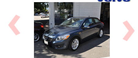
Volvo 2011 c30 $25,750