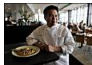
Slanted Door opened the door