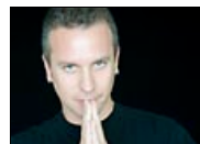
I wanna be your exorcist