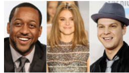
Photos: 'Dancing With the Stars' Season 14 contestants