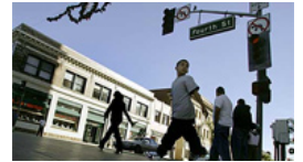
Wealthy are more likely to cheat, experiments find

Terms of Service | Privacy Policy | Los Angeles Times, 202 West 1st Street, Los Angeles, California, 90012 | Copyright 2012