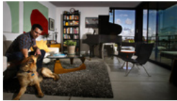
Photos: Apartment living for a new generation