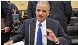
Record $375-million Medicare fraud alleged