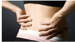
Keeping your lower back pain-free